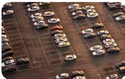
• Application-Parking Lot